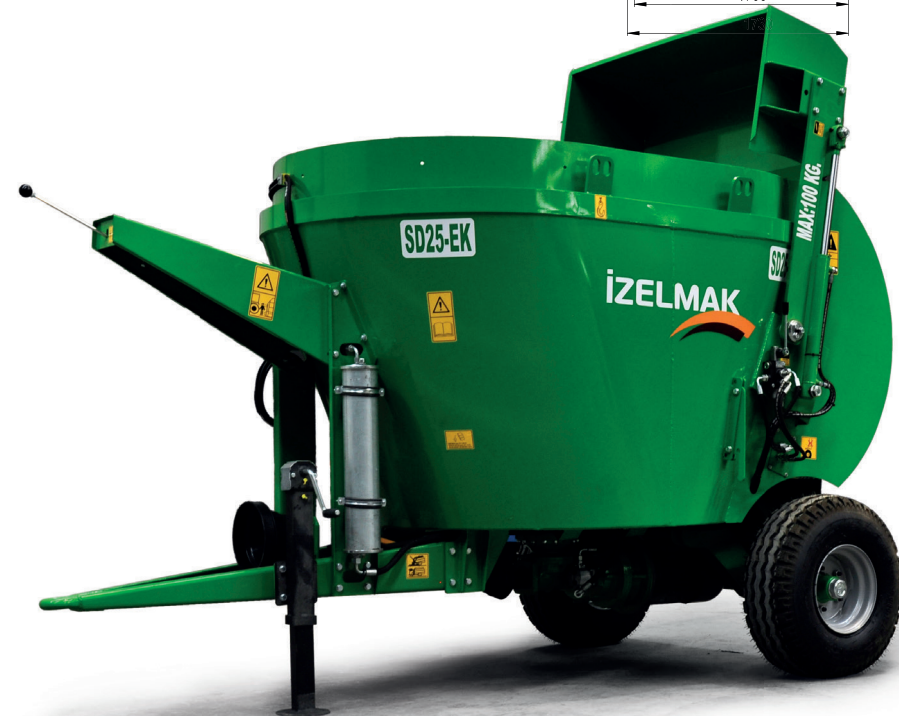
VERTICAL FEED MIXERS