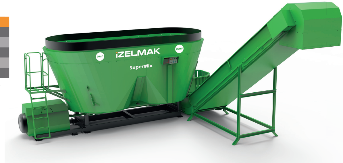
SABİT YEM KARMA MAKİNALARI

Depending on added options, the specified features can be change.